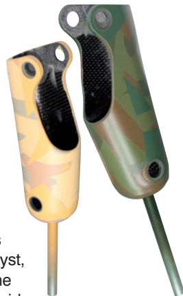
Composite prosthetics finished with low weight epoxy primer-filler IP3-00019 and IP6 grade 2K PU finishes.

IP3-00020 Low VOC Epoxy In-Mould Primer is almost always used with fast set up catalyst, and is applied to the inside surfaces of the moulding tool. After curing the mould is laid up either with a pre-preg system, or fibre matting and resin injected. On removal of the part after curing, the primer surface has become an integral part of the component, and the surface will mirror the smooth internal finish of the mould.